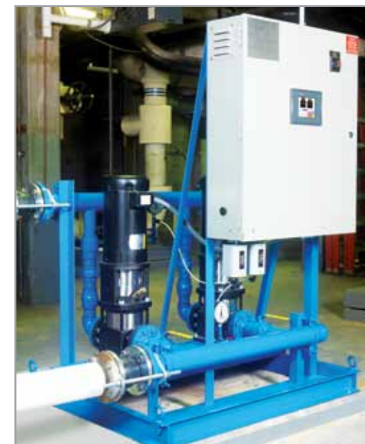
This TDH+ Model meets the constant demands of a university dorm.

The UL-QCZJ system features a factory certified and tested UL 508-A control panel and tested pump system for reliable, uninterrupted operation upon arrival at the jobsite.