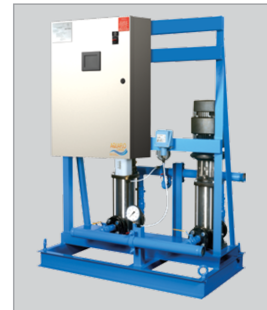
TDH+ Model has a smaller footprint.

The model also offers both constant and variable speed; changeable orientation of headers; NEMA 1 and 4 enclosures; and a split-base option.