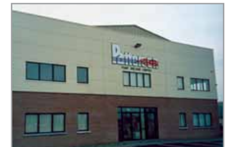
Patterson Toccoa, GA, Headquarters (above). Patterson Mullingar, Ireland, Factory (right).