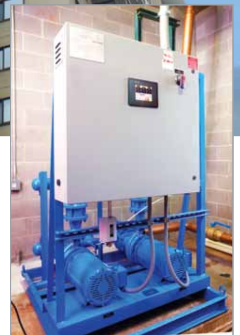
From the first floor to the penthouse, residents in this metropolitan condo (above) enjoy reliable water delivery with this Aqua~FloPac package (right) working efficiently down below.