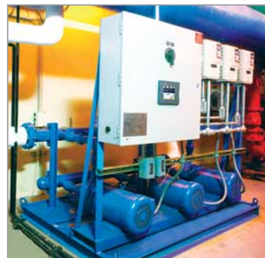
This Aqua~FloPac™ VFD package serves a 3-story office building.

Capacities are only limited by shipping restrictions. UL-QCZJ Listed.